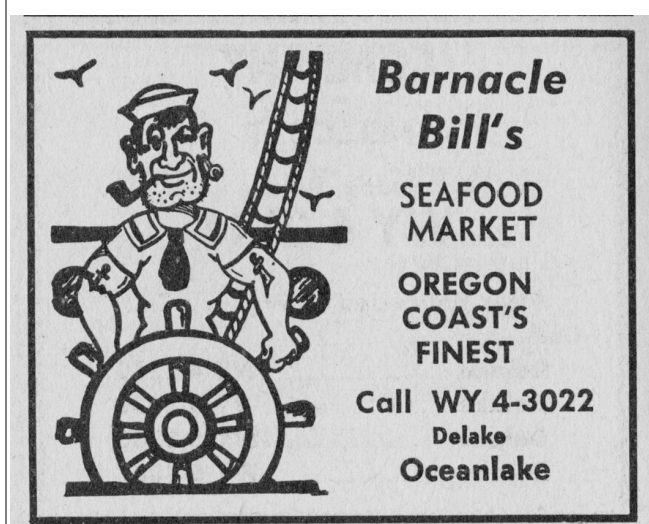
BarnacleBill's Ad, 1950s