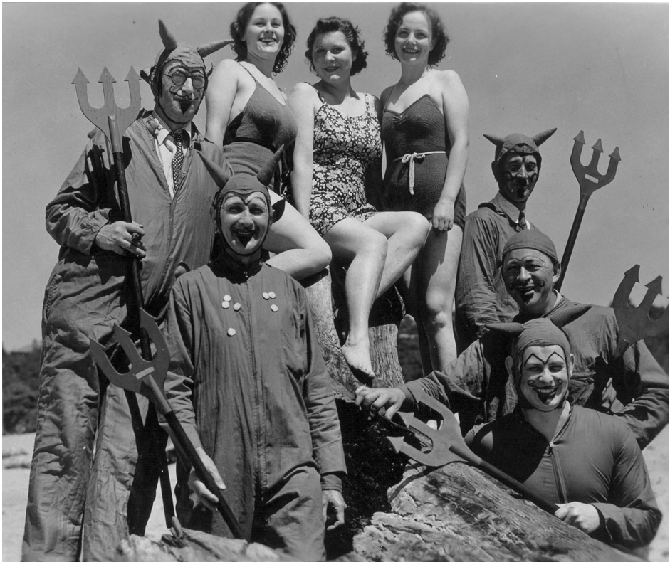
The Red Devils and other participants in the Redhead Roundup pose for a photo in the 1930s (above).

A new exhibit, “The Devils of North Lincoln County,” opens Saturday, Feb. 8 and will run for all of 2020. The exhibit will showcase Red Devils photos, quotes from those who have experienced them, and artifacts, including a four-foot-tall parade float devil head, several Red Devil costumes, and more! The Red Devils group formed in Taft and Devils Lake in 1933 to promote events like the Redhead Roundup and Devils Lake Regatta. The group promoted events and entertained