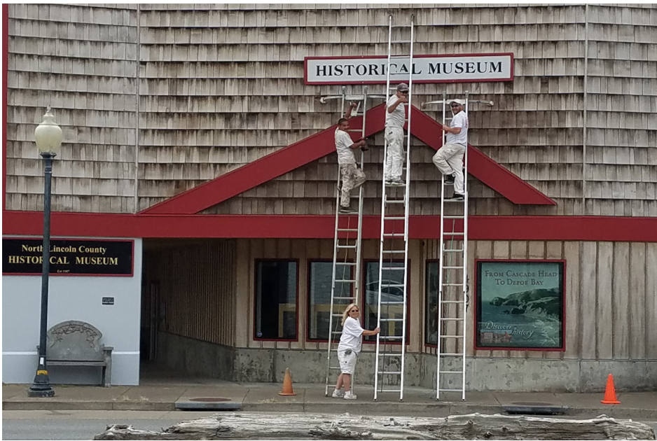
Quality Painting Service staff installing newly restored museum signage.