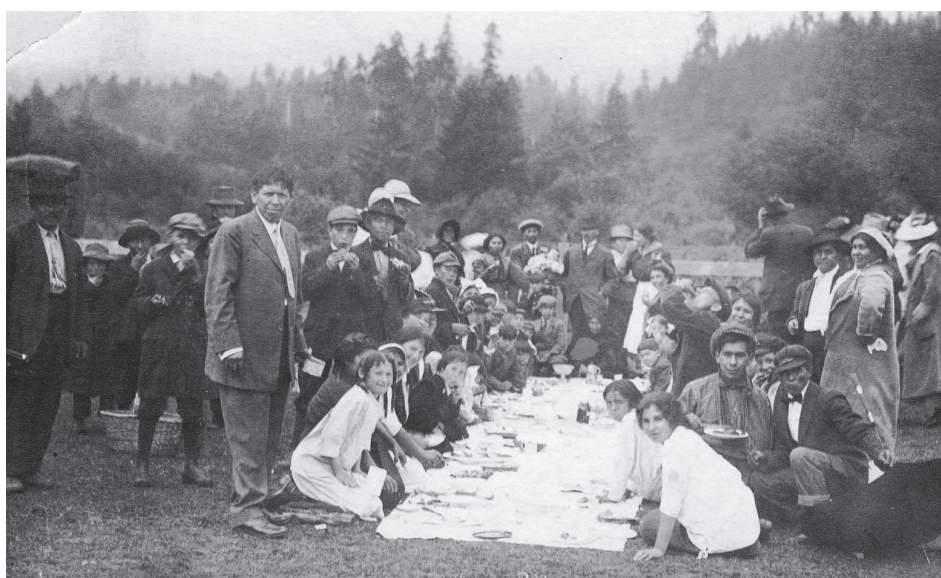
A community picnic from history, ca. 1912