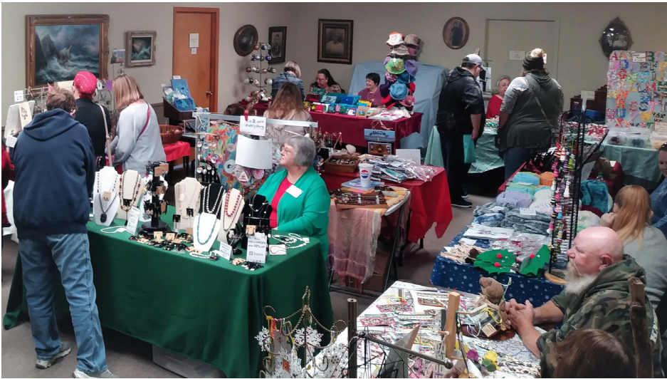
Last year's craft fair (photo above) was a big hit.