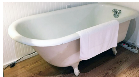
1925 claw-foot tub from the Green Onion in Nelscott. Bathing facilities were scarce so the owners rented baths.

Visit the museum website and click on the virtual exhibit logo. Once you're there, click on any of the 14 artifacts to reveal their stories through newspaper articles, documentation, information, links, historic photographs, and more.