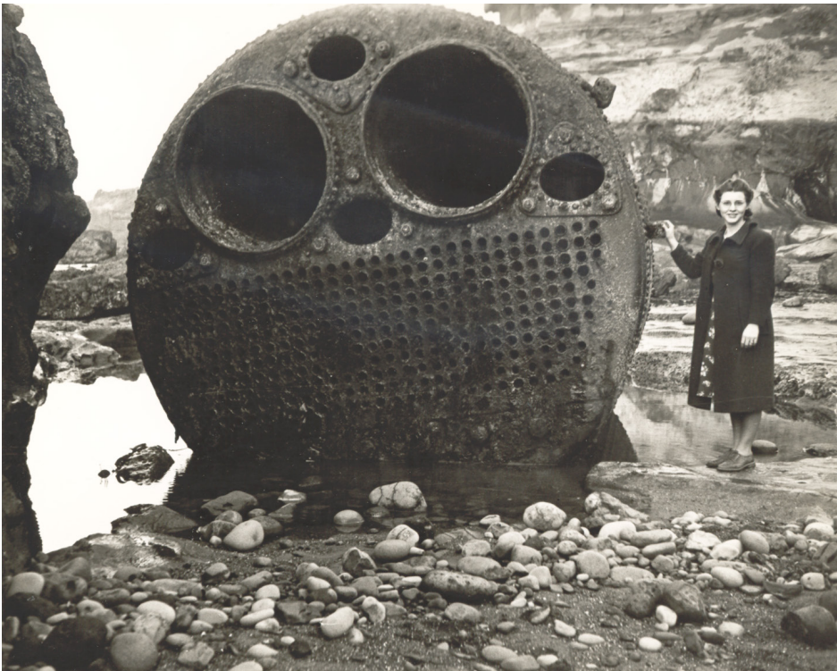
DID YOU KNOW? On May 19, 1910, the steam schooner “Marhoffer” caught fire about three miles from shore when a blow torch exploded in its engine room. All but one crew member (the ship’s chef) made it to shore safety as the flaming boat drifted towards shore. It soon broke up in the heavy surf and all that remained was a warped, rusted boiler that now gives the bay, just north of Depoe Bay, its name. The boiler is still there today, visible at low tide.

Gifts to the museum are a great way to honor loved ones. Call for information.