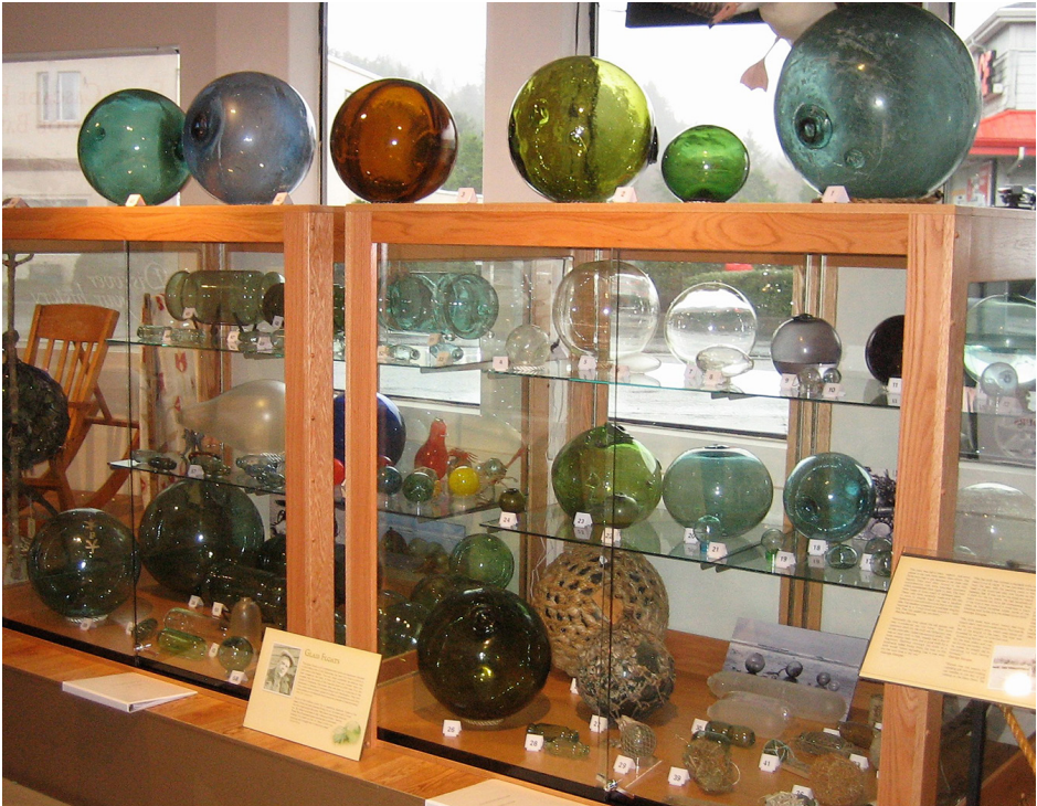
A shiney array of glass floats will have an on-going presence in the museum. The opening of this new exhibit was well attended.