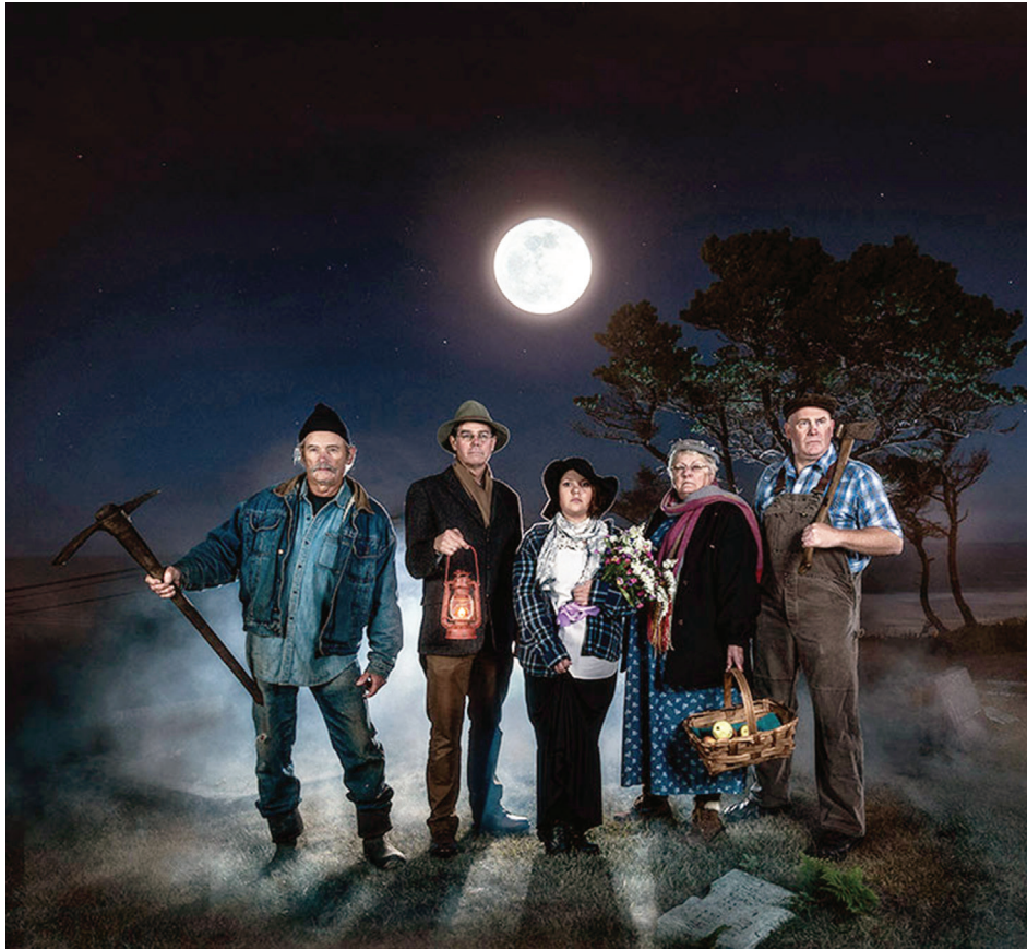
Actors from Theatre West bring permanent residents of Taft's Pioneer Cemetery back to tell their stories for October's "A Tour to Die For."

4907 SW Hwy. 101, Lincoln City OR 97367 Telephone: 541-996-6614 e-mail: director.nlchm@gmail.com Web: www.northlincolncountyhistoricalmuseum.org www.facebook.com/NLCHMuseum