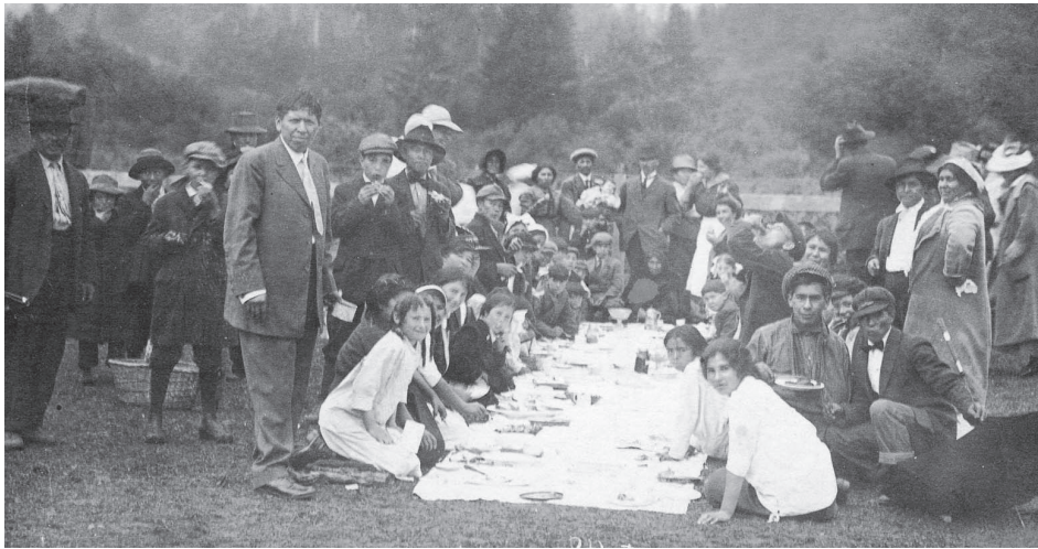
Pioneer picnic, ca. 1912