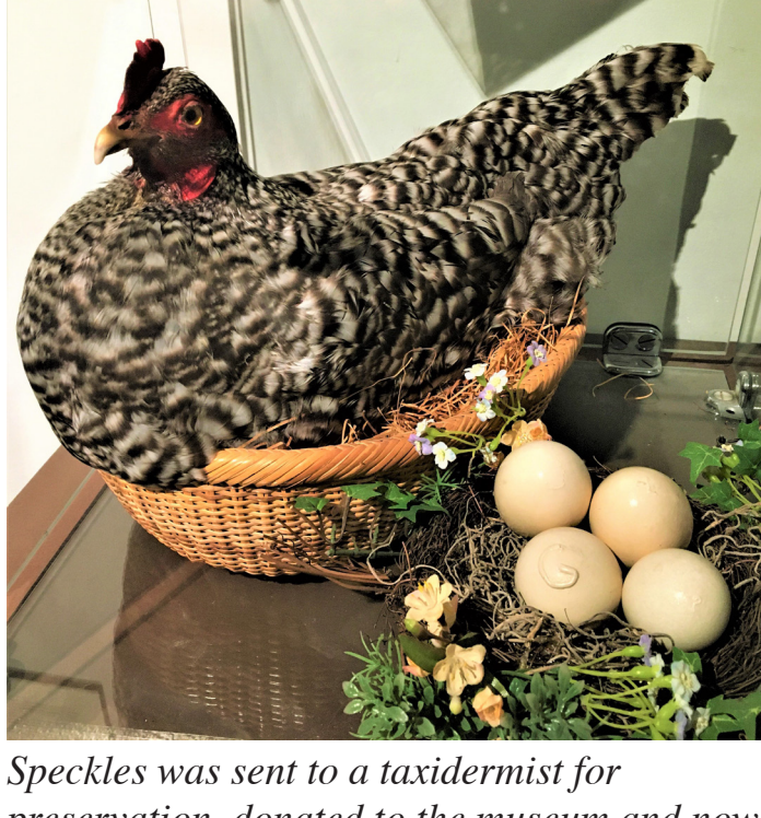
Speckles was sent to a taxidermist for preservation, donated to the museum and now resides in the kids' room.

Speckles GG, the hen who laid eggs with mysterious letters on them, has joined the other storied artifacts in the museum's virtual exhibit, "Every Artifact Has a Story."