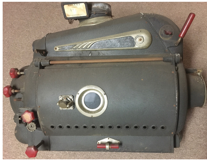
Ashcroft Suprex Lamphouse (above) from the projector system of the old Lincoln Theatre and a photo showing how the lamphouse would have worked in a whole projection system right).

The prize find was an Ashcroft Suprex Lamphouse from the projector system for the theater. This art deco style projector surely played some of the classics from the 40s and 50s and helped bring joy to many North Lincoln County residents. The lamphouse will soon shine once again when it is on display in the museum's little theater, which also has some of the chairs from the Lincoln Theatre.