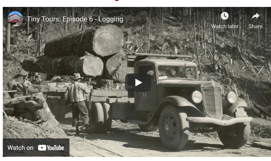
Screenshot from digitized Tiny Tours logging exhibit

All of the digital tours of ground-floor exhibit galleries have been completed and we have lugged the camera gear upstairs. Tiny Tours of our Glass Fishing Floats, Mini Theatre, Native American Exhibit, Homesteading Exhibits, Fishing/